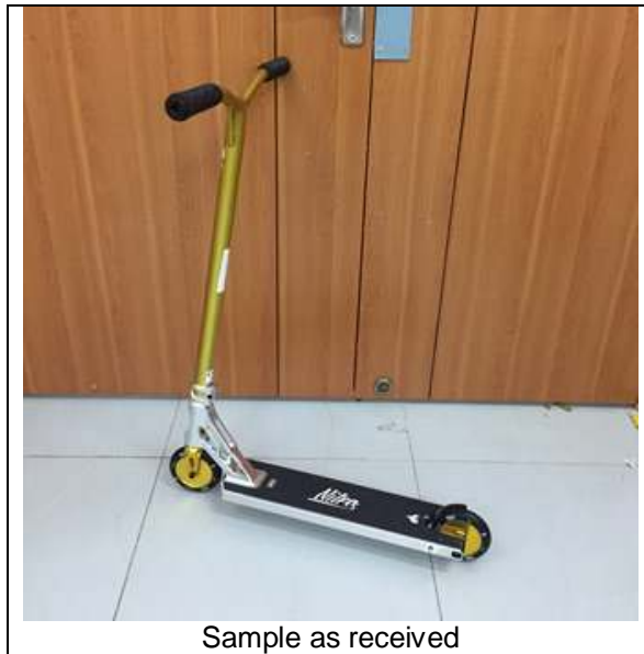
Sample as received